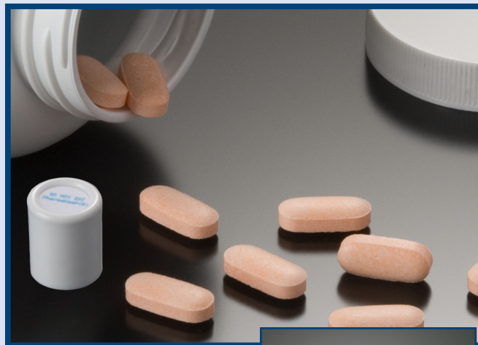
PharmaKeep® oxygen scavengers work in low relative humidity package environments and are available in canister and packet configurations.

Unlike some oxygen scavengers, PharmaKeep does not contain bromide.